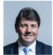
Mr Stephen Metcalfe MP